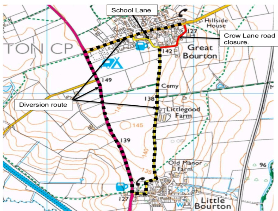
Great Bourton – Crow Lane road closure and diversion route.

T7379/AC TTRORequests@oxfordshire.gov.uk