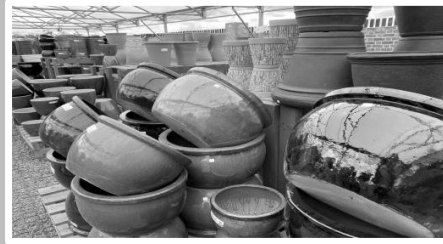
Pots All shapes and Sizes