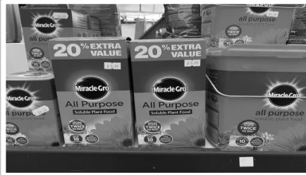
All you'll need for your garden In one place