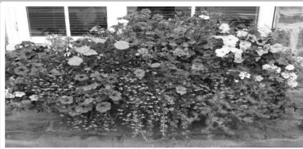
Summer Hanging Baskets Orders by 21 st April