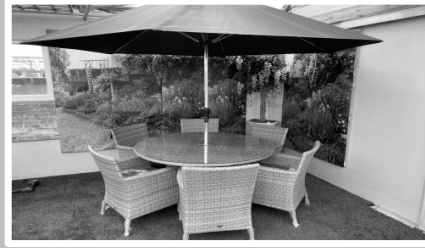
Garden Furniture Great Range