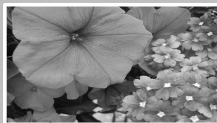
Bedding & Basket Plants Grown here on Site