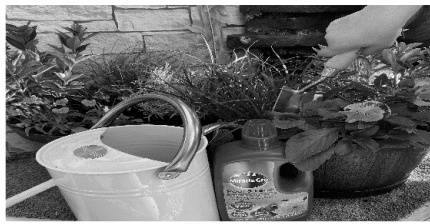
You'll find all you need for your garden In one place