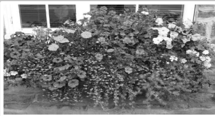
Summer Hanging Baskets Great Selection