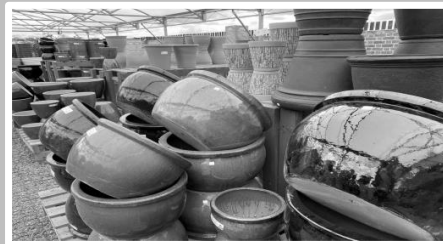
Pots All shapes and Sizes