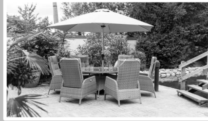
Garden Furniture Great Range