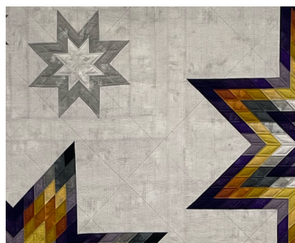
Quilting by Julie Tomlin - see page 7