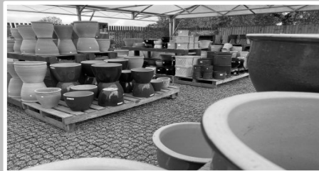
Pots All Colours and Sizes