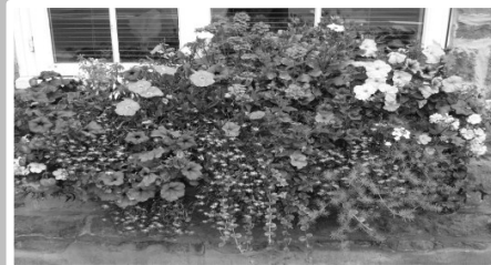
Summer Hanging Baskets Orders now being taken

Barn Farm Plants Gift Vouchers...make a great GIFT!