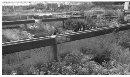
Ideal time to plant ... Garden Plants