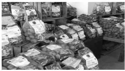
All you'll need for your garden A fantastic Range