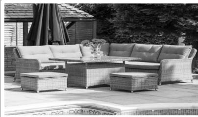
Garden Furniture & Water Features Great Selection