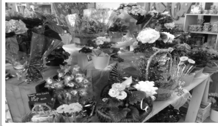
Mother's Day Gifts and Flowers