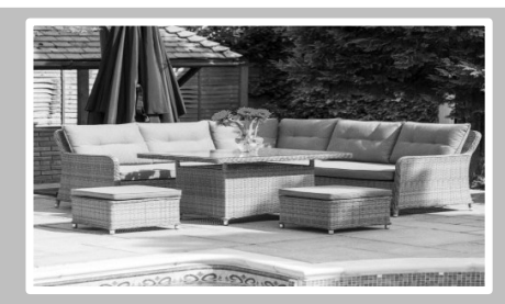
Garden Furniture Great Range