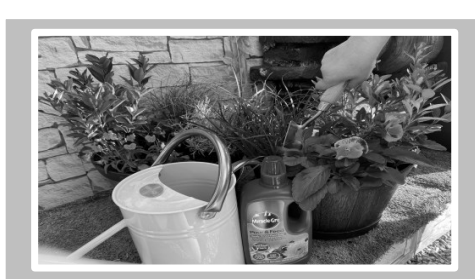
All you'll need for your garden In one place