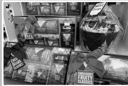
Festive Food Fantastic Range