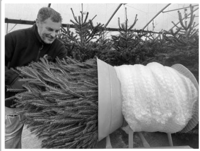
Christmas Trees Individually hung ...then wrapped to take home