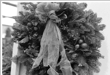
Fresh Spruce Wreath Created just for you... or ready made