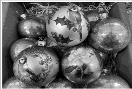
Decorations, Lights and Gifts Dazzling Selection