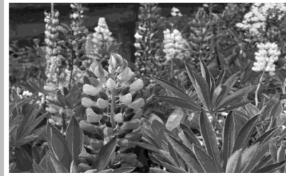
Alpines and Perennials 9cm - £2.99 or 5 for £12 1ltr - £4.99 or 3 for £13