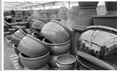
Pots All Shapes and Sizes