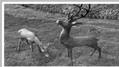
Garden Art Spoilt for Choice