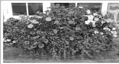
Summer Hanging Baskets New or refills Orders Being Taken