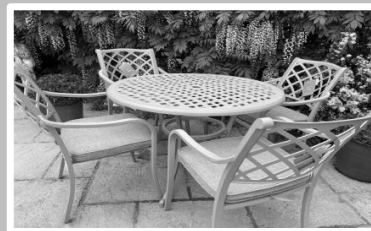
Garden Furniture Just Arrived...New Range