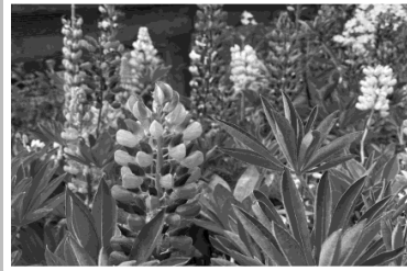
Alpines and Perennials 9cm - £2.99 or 5 for £12 1ltr - £4.99 or 3 for £13