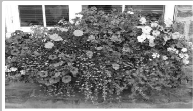
Hanging Baskets Grown and Created Here!