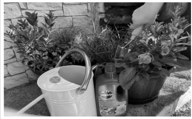
All you'll need for your garden In one place