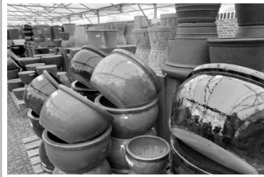
Pots All Shapes and Sizes