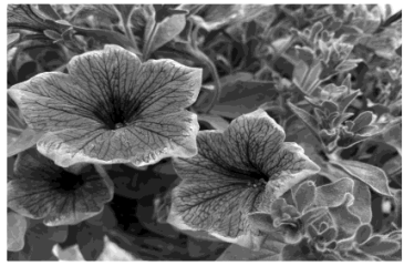
Bedding Plants & Hanging Baskets Grown & Created Here