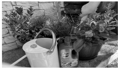
All you'll need for your garden In one place