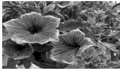
Bedding Plants Grown Here