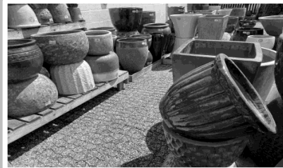
Pots Great Offers