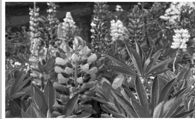
Alpines and Perennials 9cm - £2.99 or 5 for £12 1ltr - £4.99 or 3 for £13