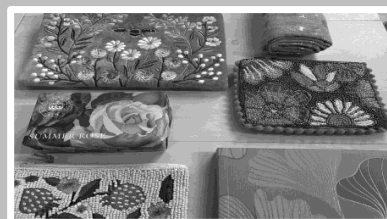
Gifts Spoilt for Choice